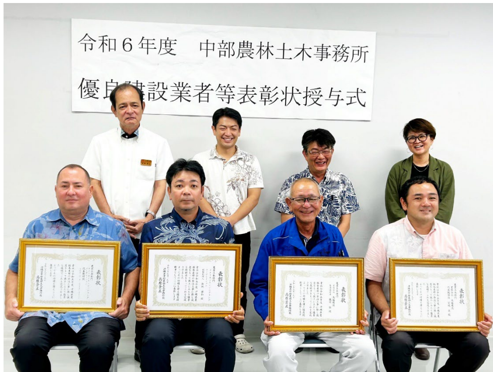
A group photo of the award recipients and the representatives for the Chūbu Agricultural Civil Engineering Office