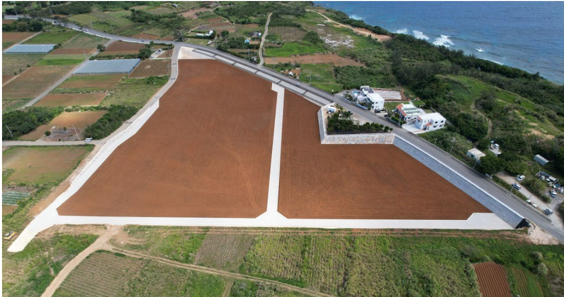
Aerial view of the completed project site